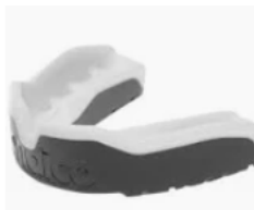
6. Mouthguard – can be purchased from school shop or any high street sports' retailer