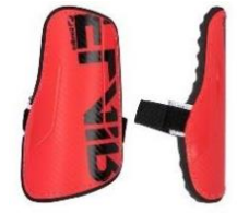
7. Shin pads – from high street