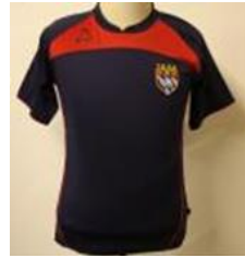
1. Reversible Red/Navy TBGS Rugby Shirt